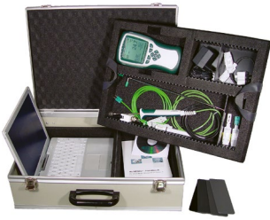
ZB 2590 TK2