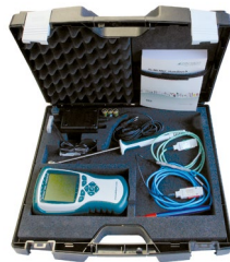
ZB 2490 TK2