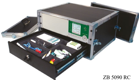
ZB 5090 RC