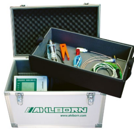
ZB 5600 TK3